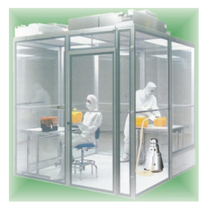
Clean Room Applications

pharmaceutical, blood, beer/wine filters and more!